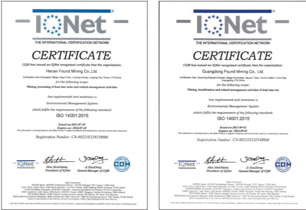
Environmental Management System Certification of Henan Found Environmental Management System Certification of Guangdong Found